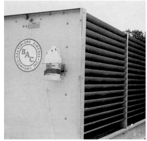
Arrange Drip Feeder so that lower end is about 1 inch below surface of sump water.

The distance that the weighted end of the capillary tubing is allowed to hang below the middle of the treatment bottle determines the feed rate. This distance is referred to as feeder head, (H), and should always be measured from the middle of the treatment bottle to the end of the capillary tubing.