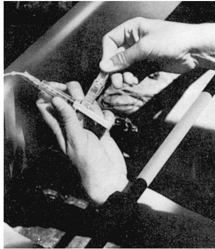
Use syringe to charge Drip Feeder.